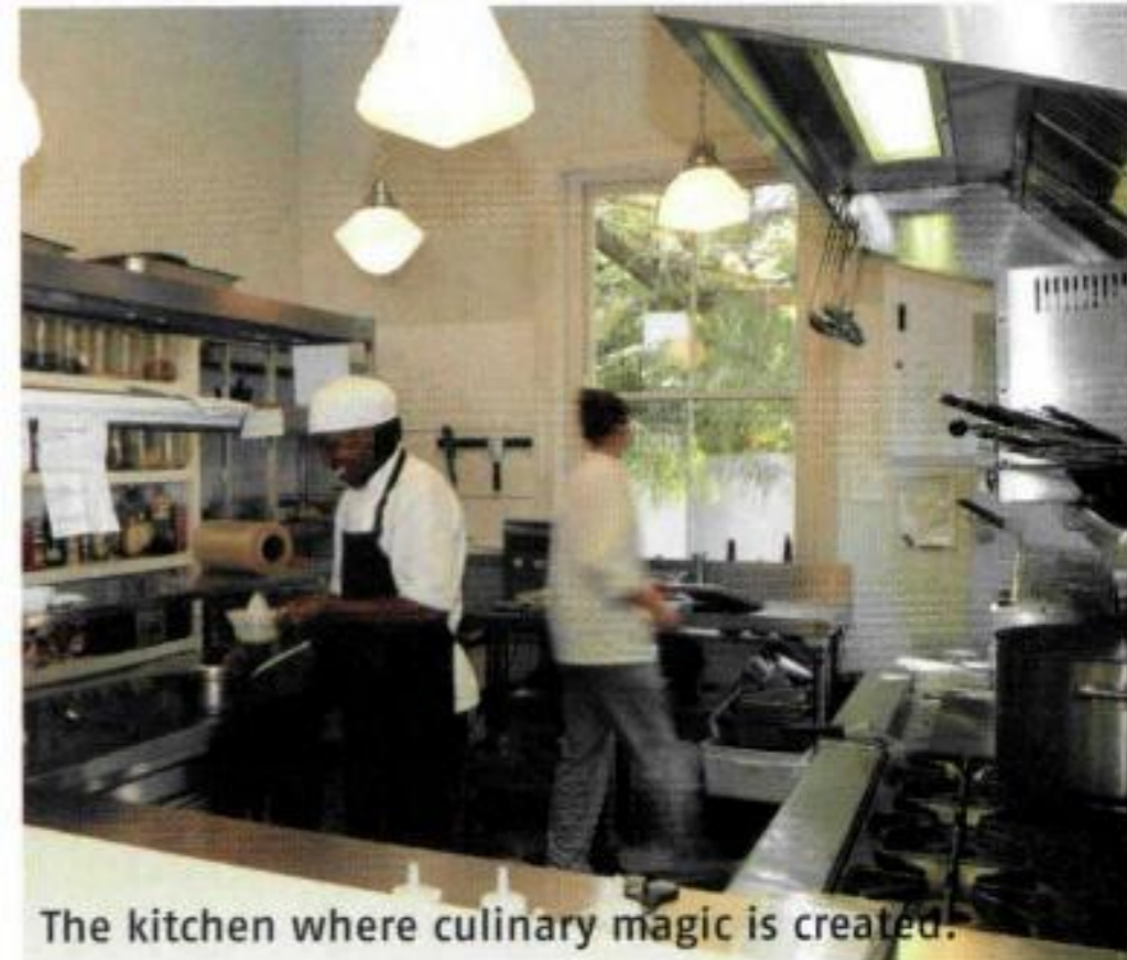
The kitchen where culinary magic is created.

winning celebrity chef Reuben Riffel – a recipe for sheer elegance and success. The recently established boutique hotel prides itself on its picturesque surroundings and simple yet contemporary architecture. The 10 luxurious guest suites, each rich with character and yet ever so modest, make for the perfect home away from home experience. However, don't despair if you can't make it to this paradise for couples, because here we bring you some of Reuben Riffel's romantic recipes for a delicious Valentine's Day celebration.